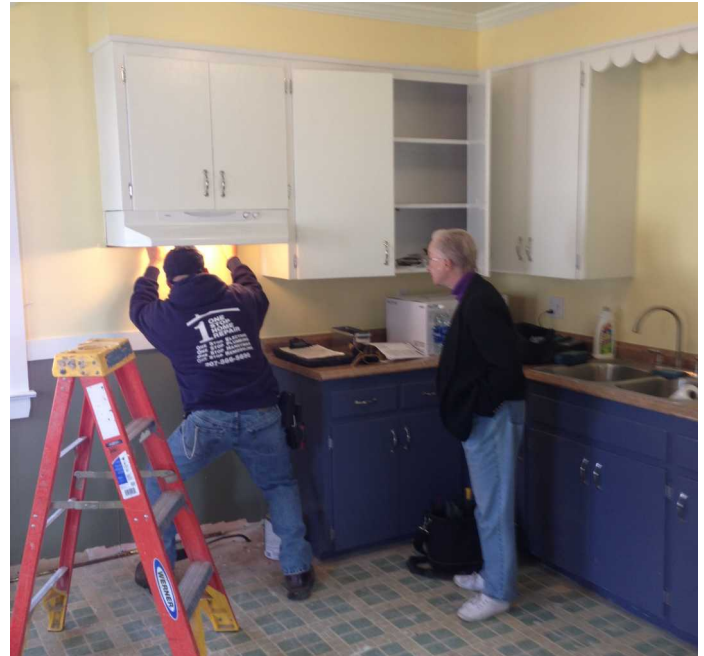
Our electrician installing a new light.

Give our office a call for any of your electrical needs. We will be glad to accommodate them. “Where One Call Does It All!” 866-5690.