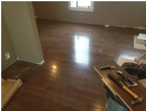
Progression on a house that is being completely redone.